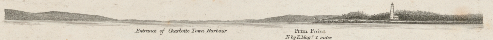
Entrance of Charlotte Town Harbour