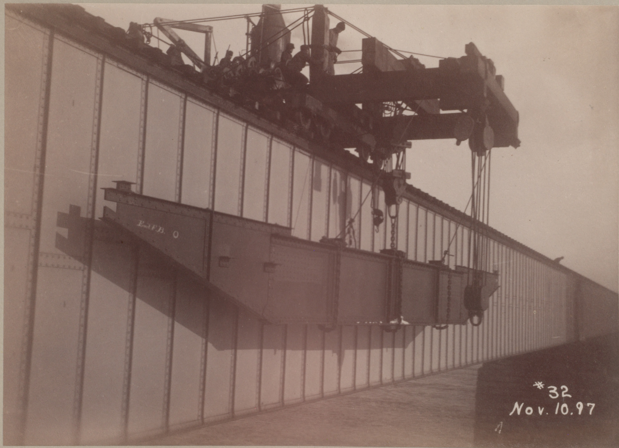
Traveller Carrying Out End Floor Beams Nov. 1897