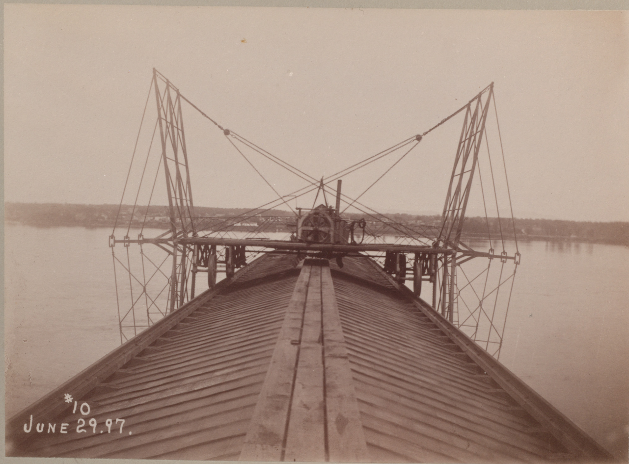
———— Former Tubular Bridge ————— ———— False Roof for Painting Traveller ————— ———— 1897 —————