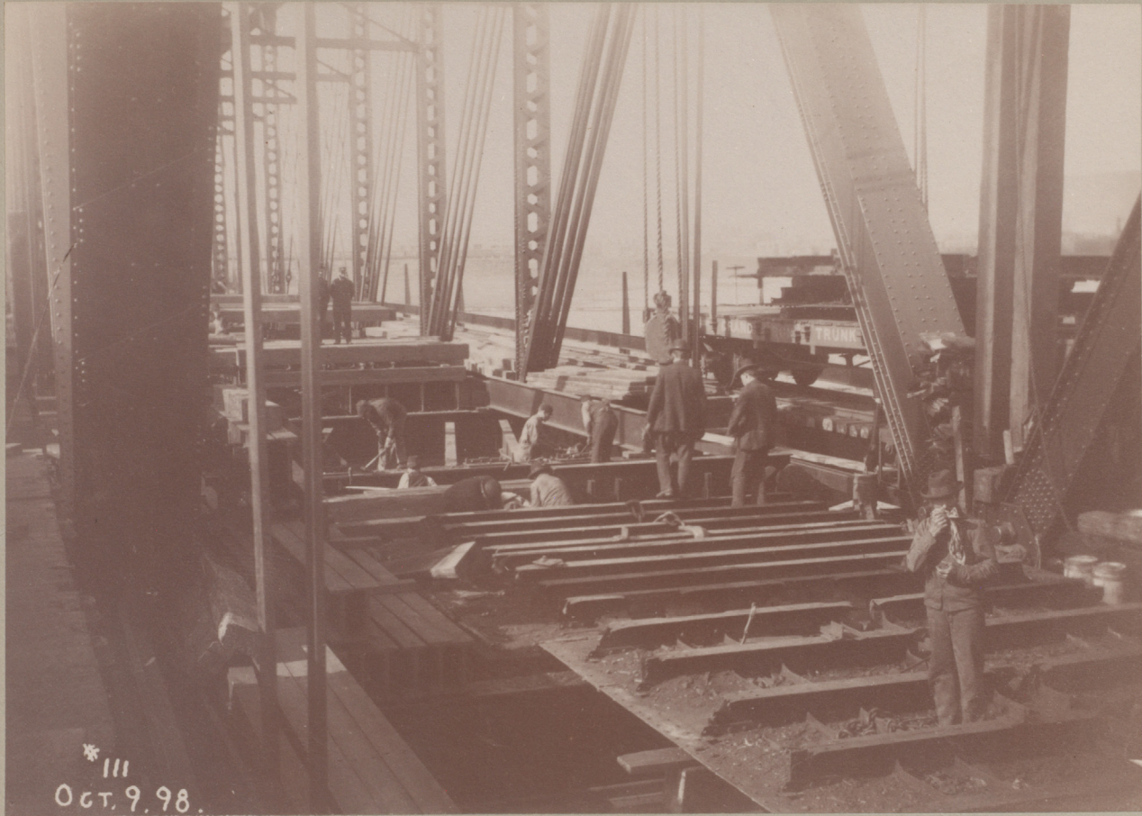
— Removal of Flooring of Old Tube —