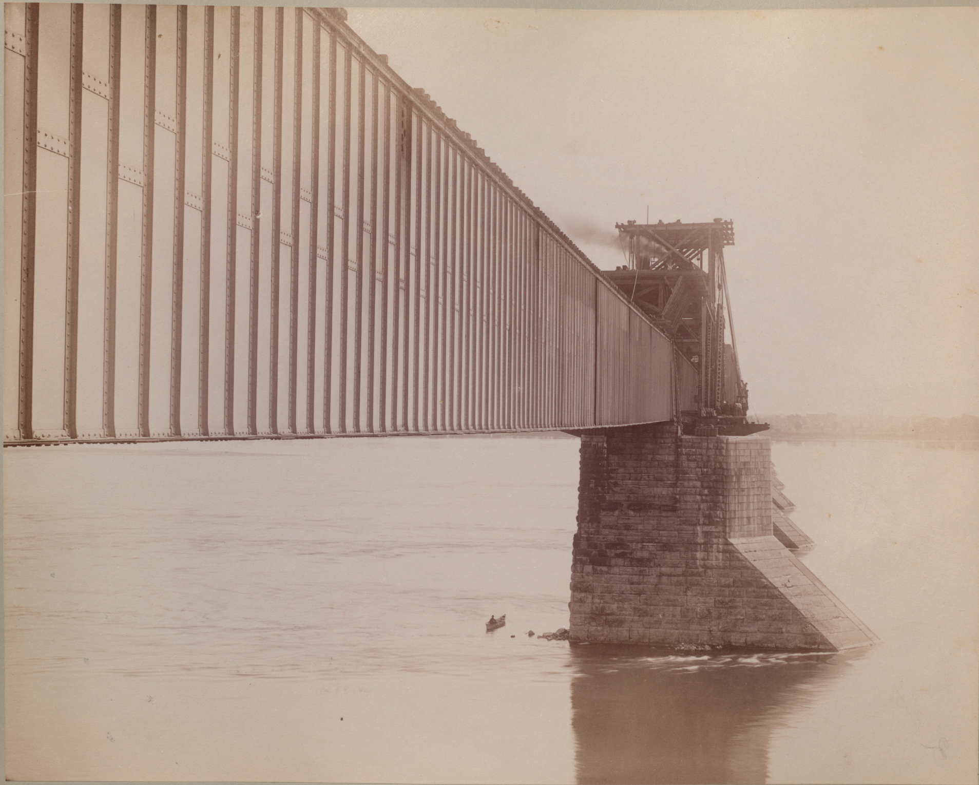
— Pier N o 13. New Masonry Complete — — July. 1898 —