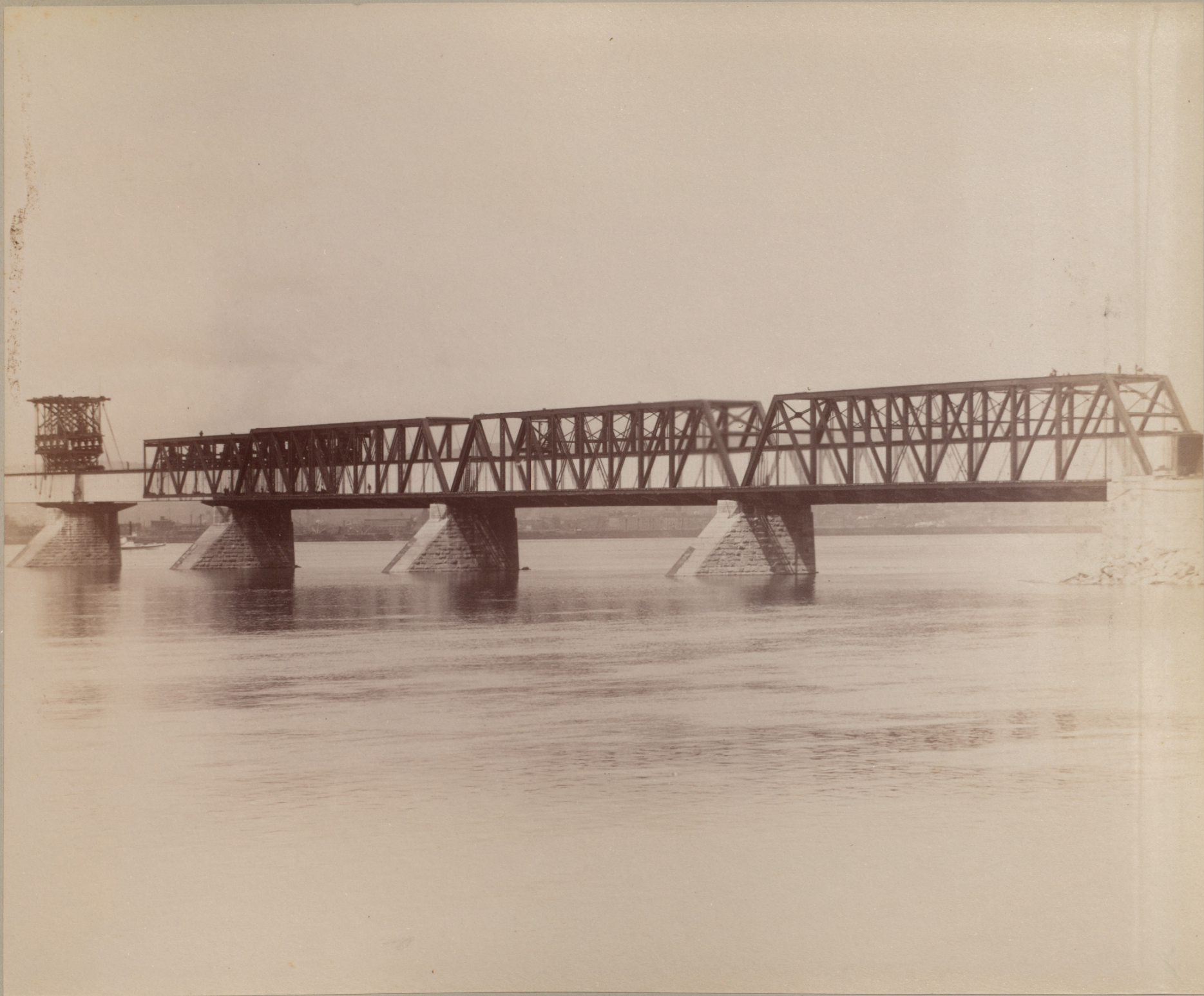
—Erection Truss Moving Over Span 22— —May 28 th 1898—