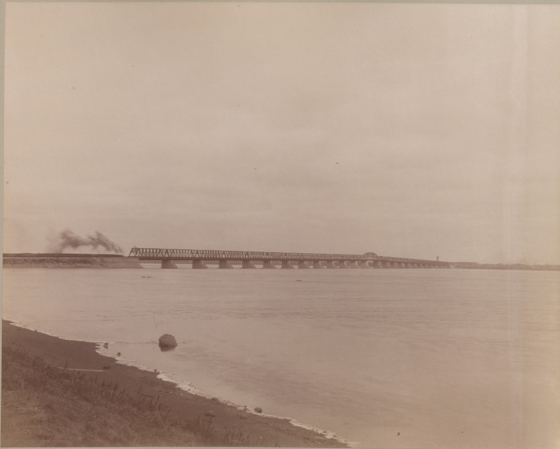
— View From Westerly Shore - Dec. 14 th 1899 —