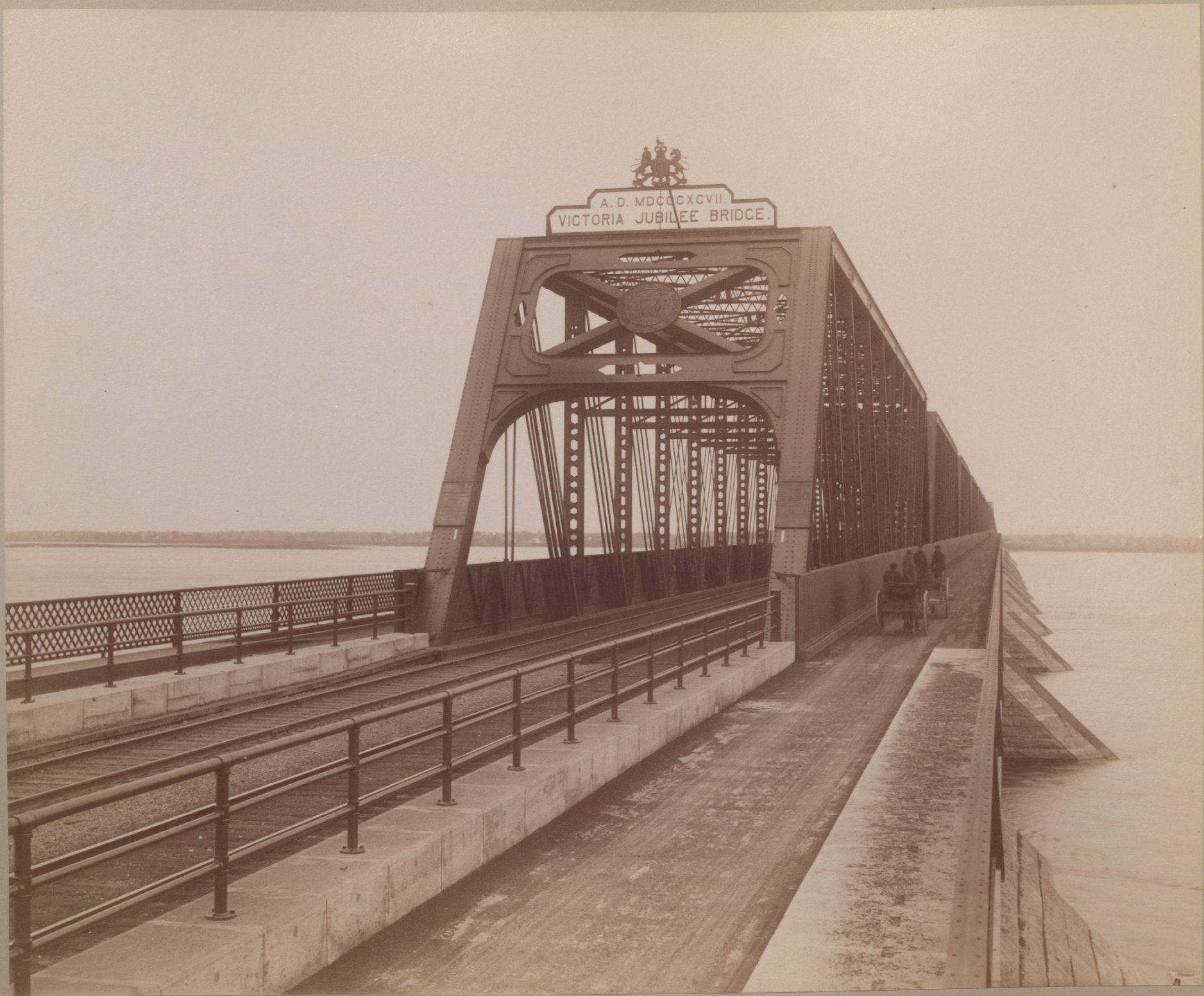
— End View - Dec. 14 th 1899 —