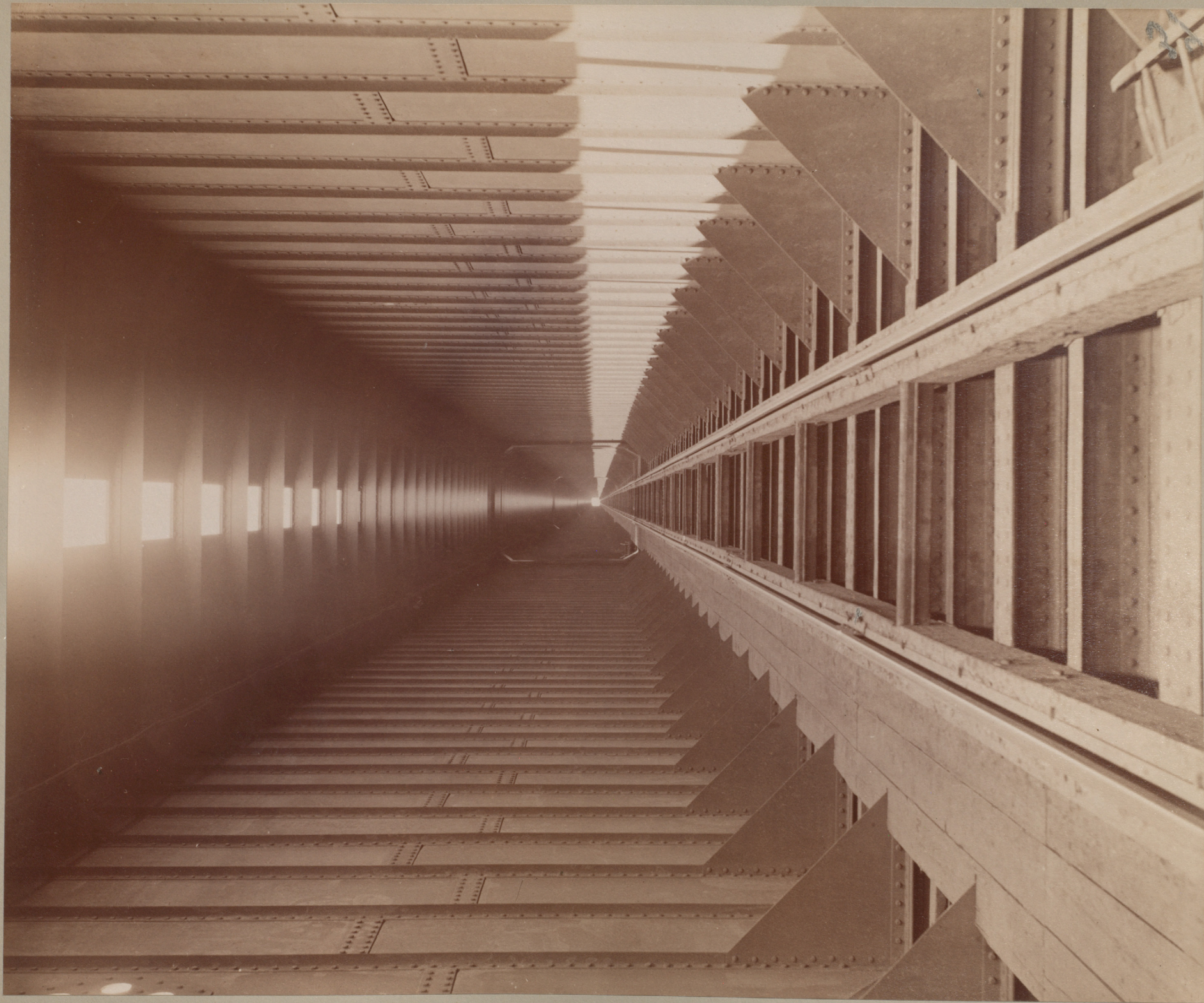
Former Tubular Bridge