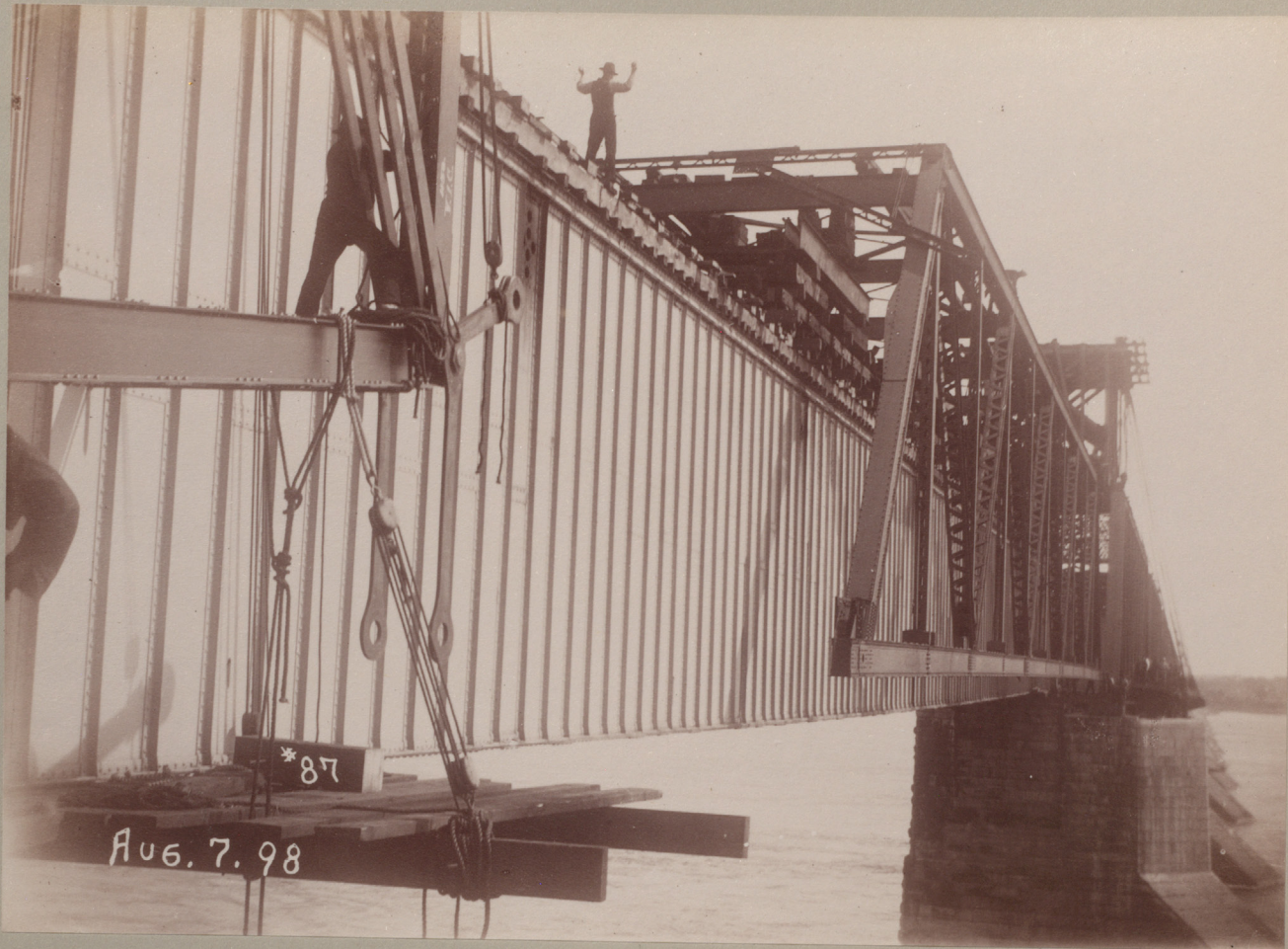
— Moving Erection Truss Over Centre Spar — — Aug. 7 th 1898 —