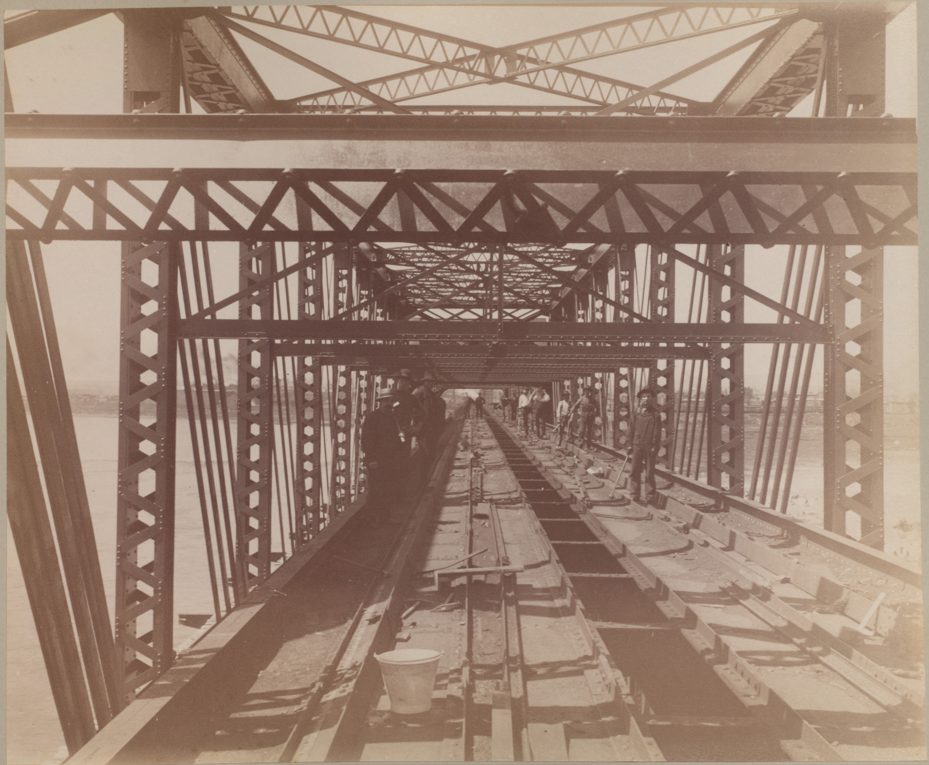
Commencing Removal of Old Tube Top View