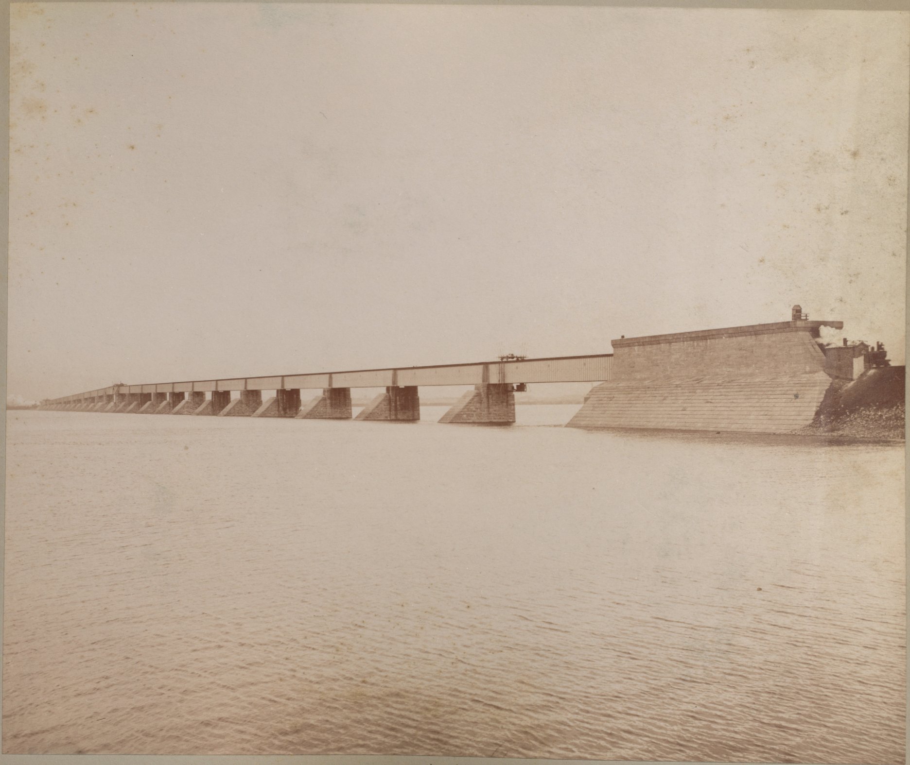
— Former Tubular Bridge — — General View from Easterly Shore — — 1897 —