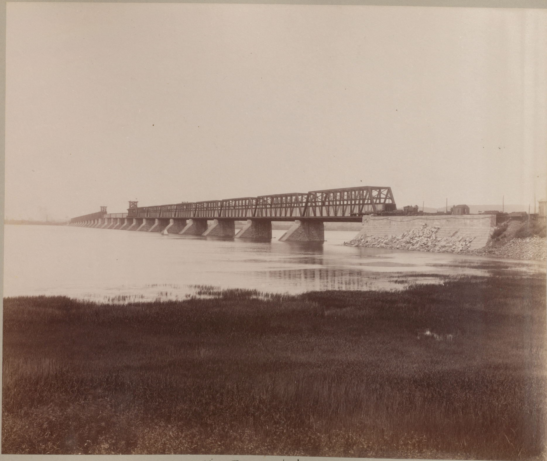
View From Easterly Shore July 1 st 1898