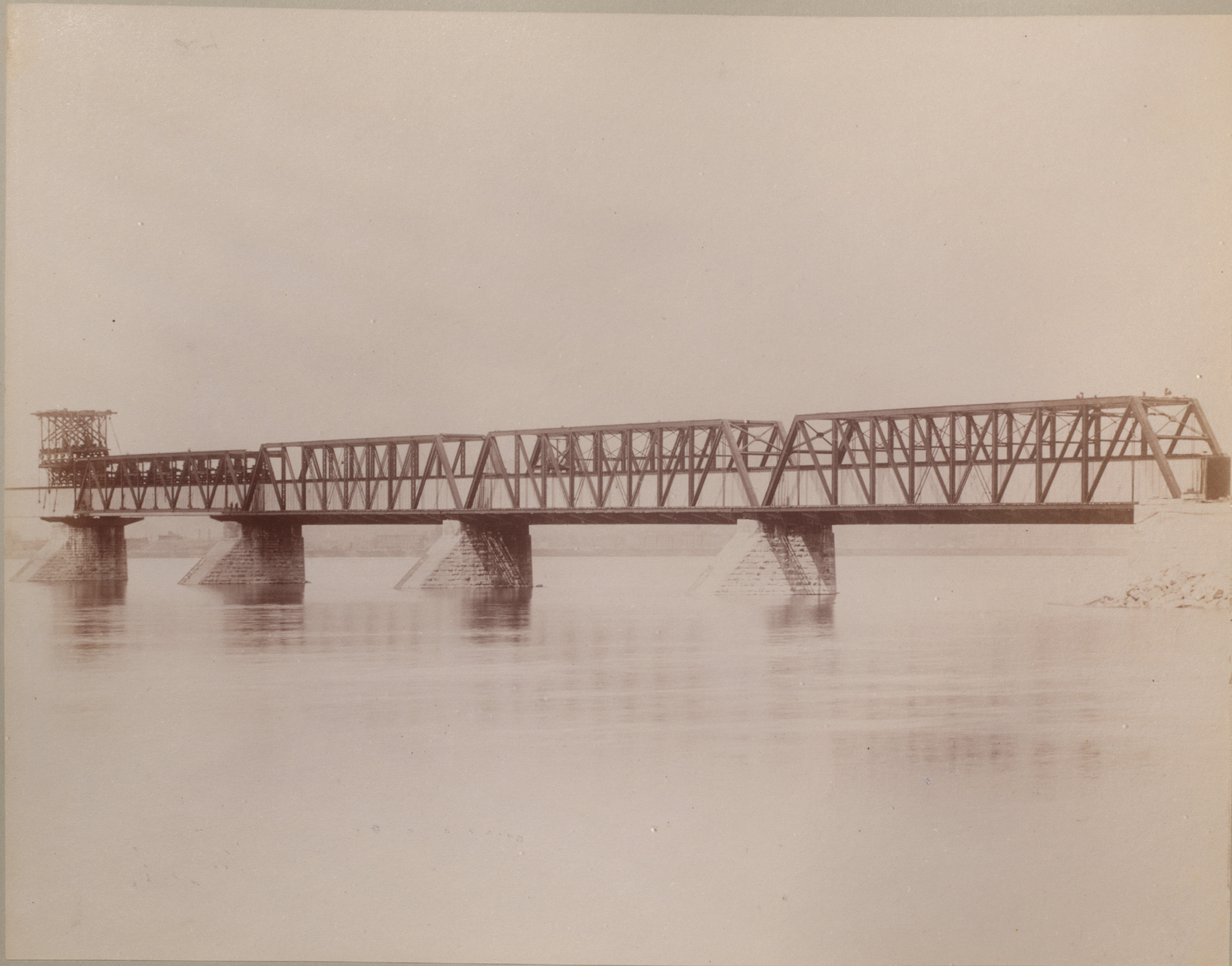
—Erection Truss in Place Over Span 22— —May 28 th 1898—