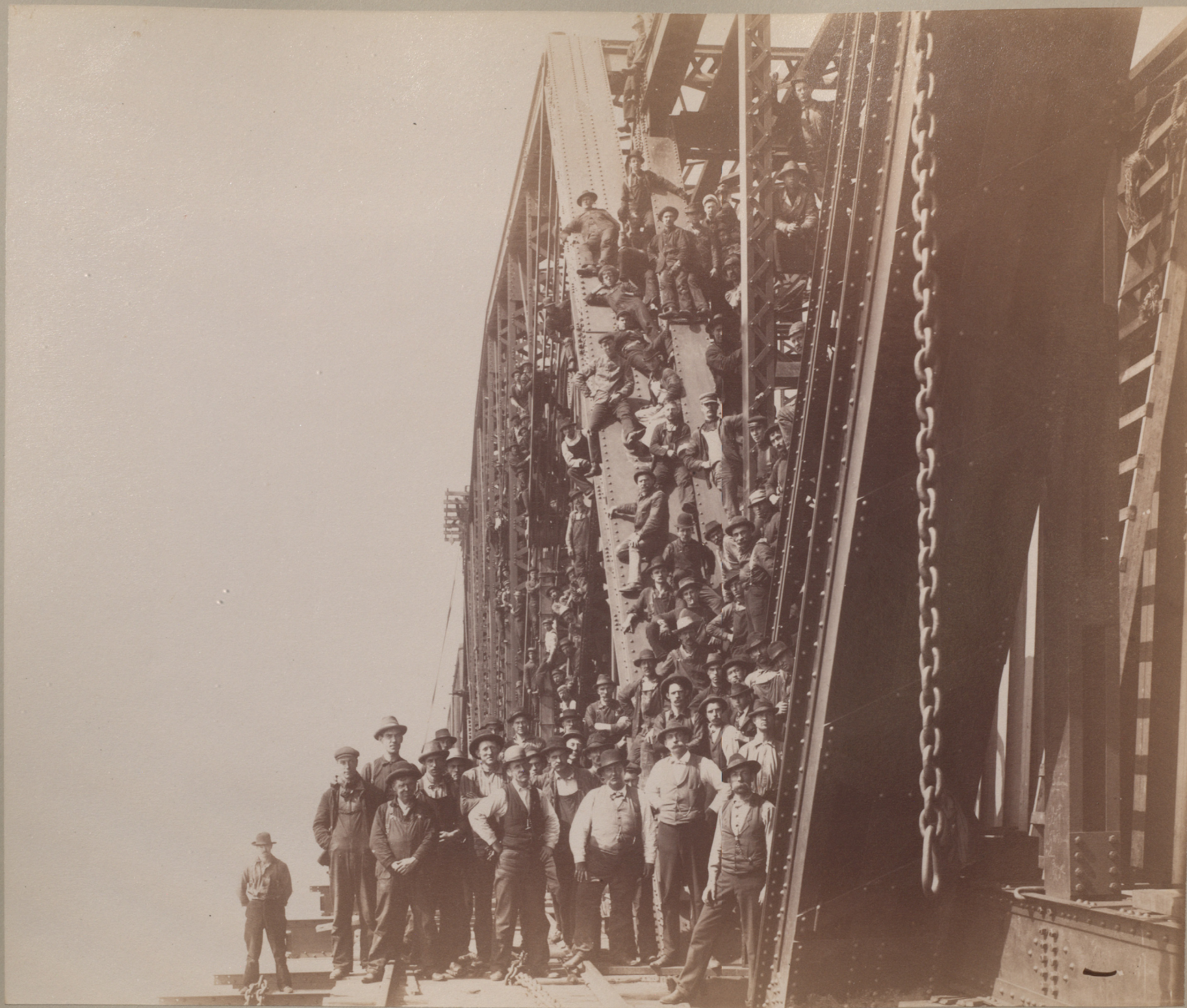
— The Men Who Did The Work —