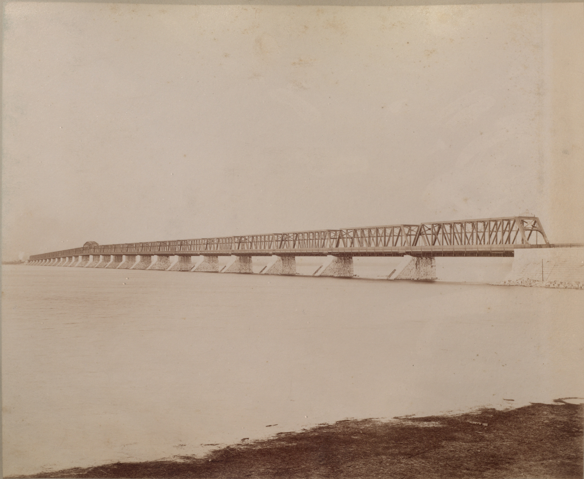
— View From Easterly Shore - Dec. 14 th 1899 —