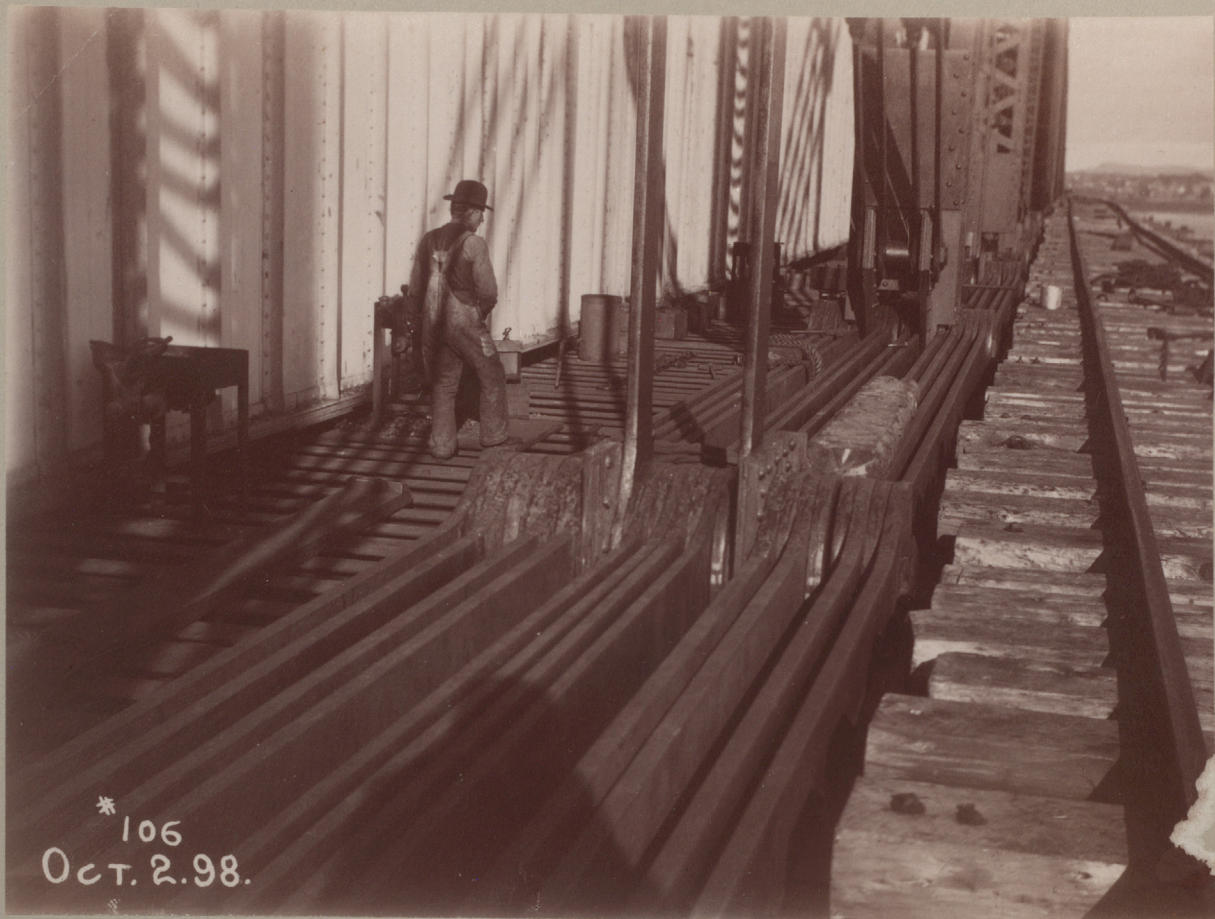
Centre Joint - Bottom Chord - Centre Span