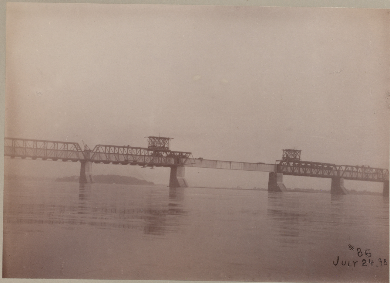
Centre Span Previous To Erection Truss Being Moved Over July 24 th 1898