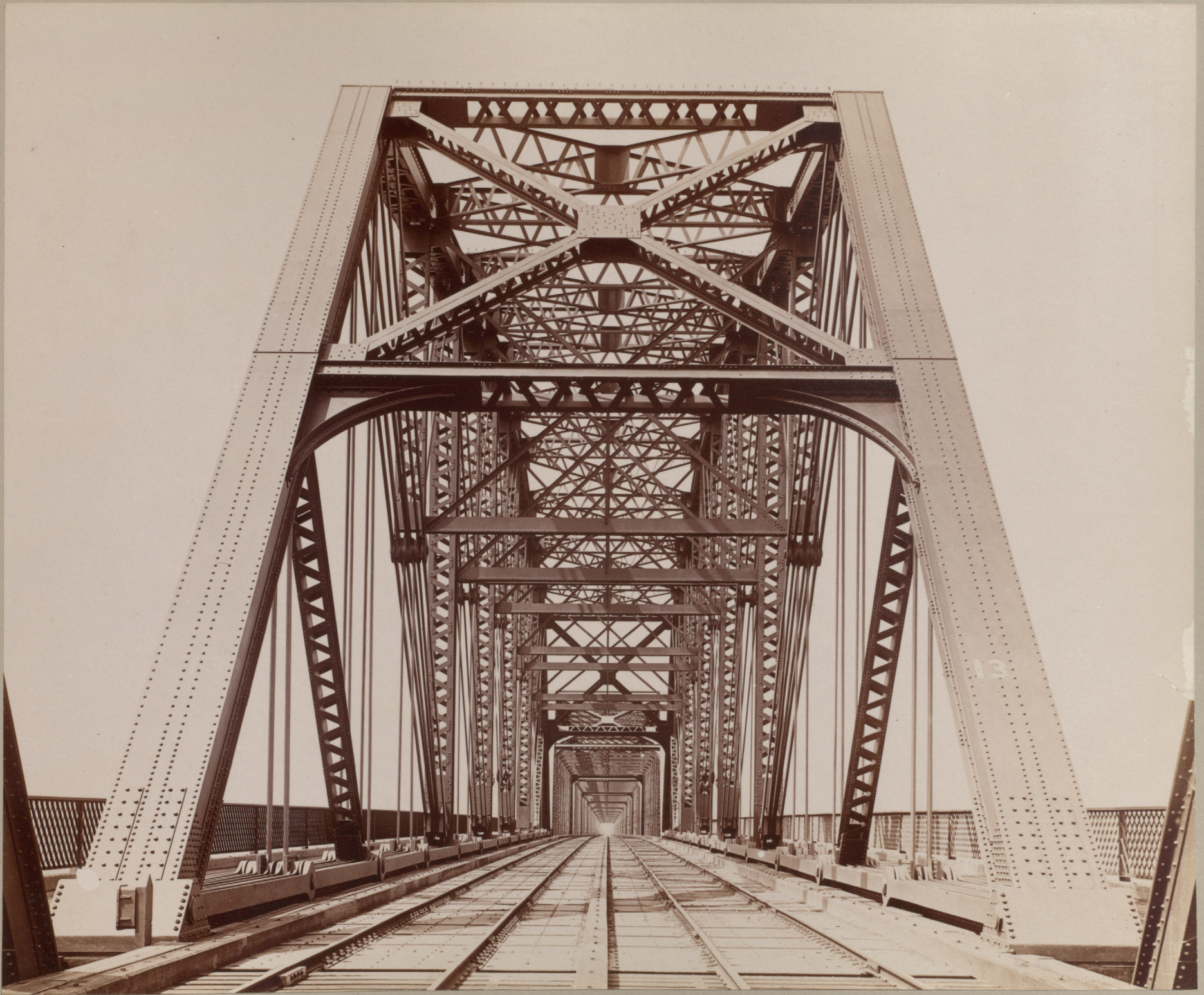
— Centre Span - July 1899 —