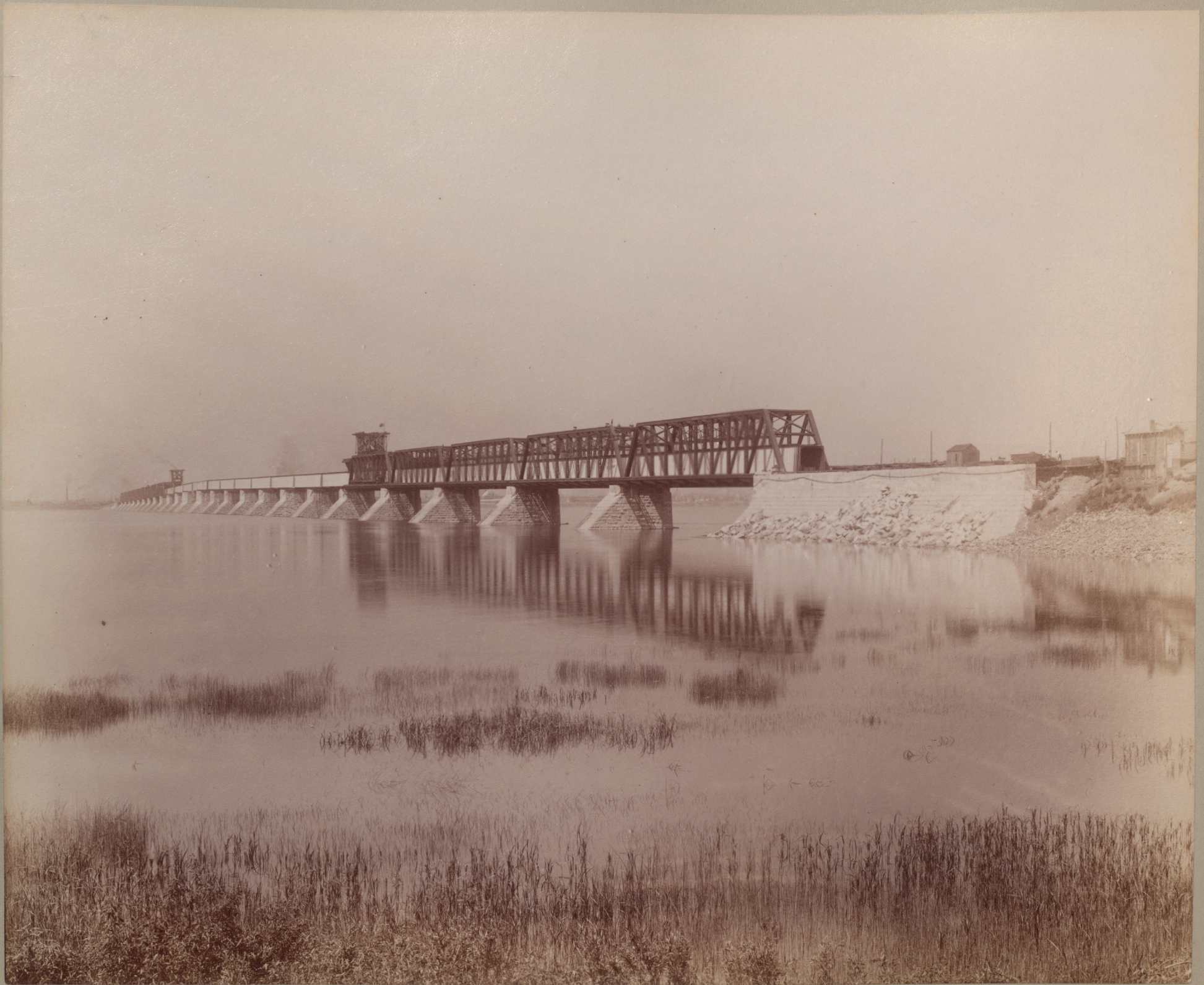
View From Easterly Shore June 7 th 1898