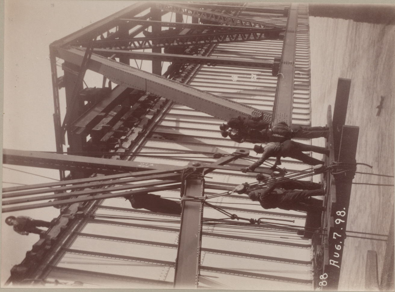
Preparing To Couple Erection Truss With Cantilever Arm — Centre Span Aug 7 th 1898 —