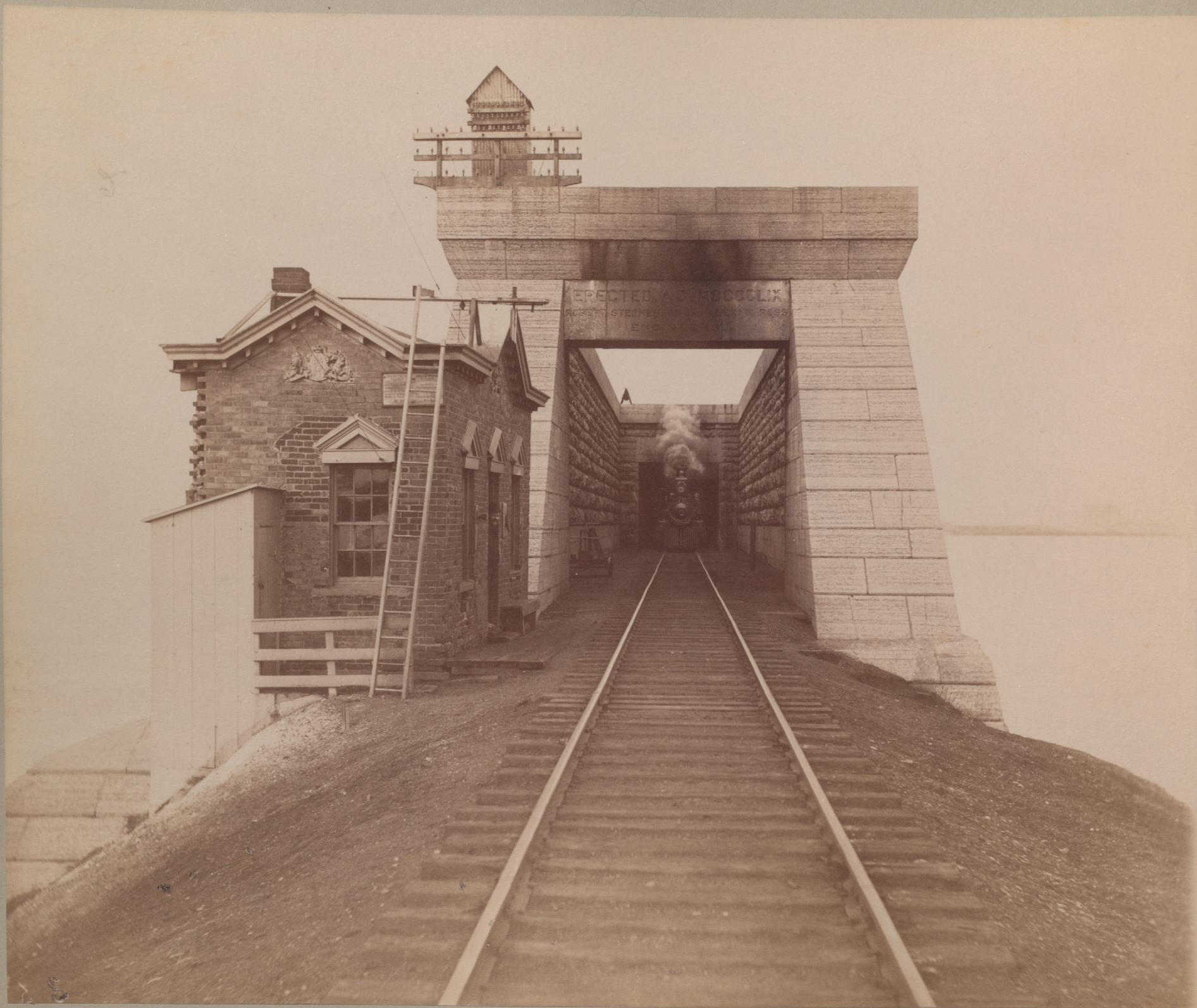
Former Tubular Bridge Easterly Portal 1897