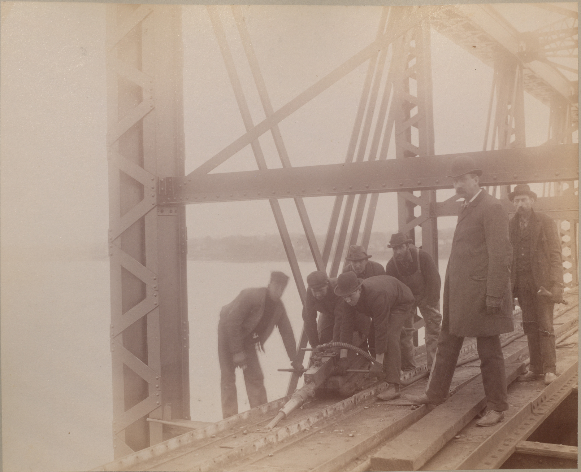
Removal of Tubes - Pneumatic Chisel At Work